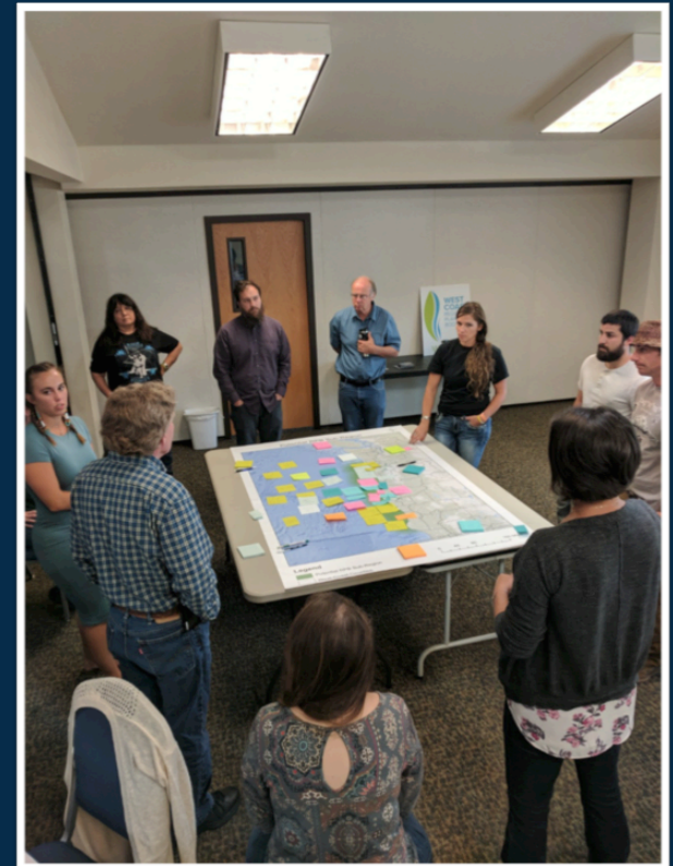
Oregon – Northern CA Tribal Meeting – Sept 2017